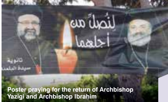
Poster praying for the return of Archbishop Yazigi and Archbishop Ibrahim