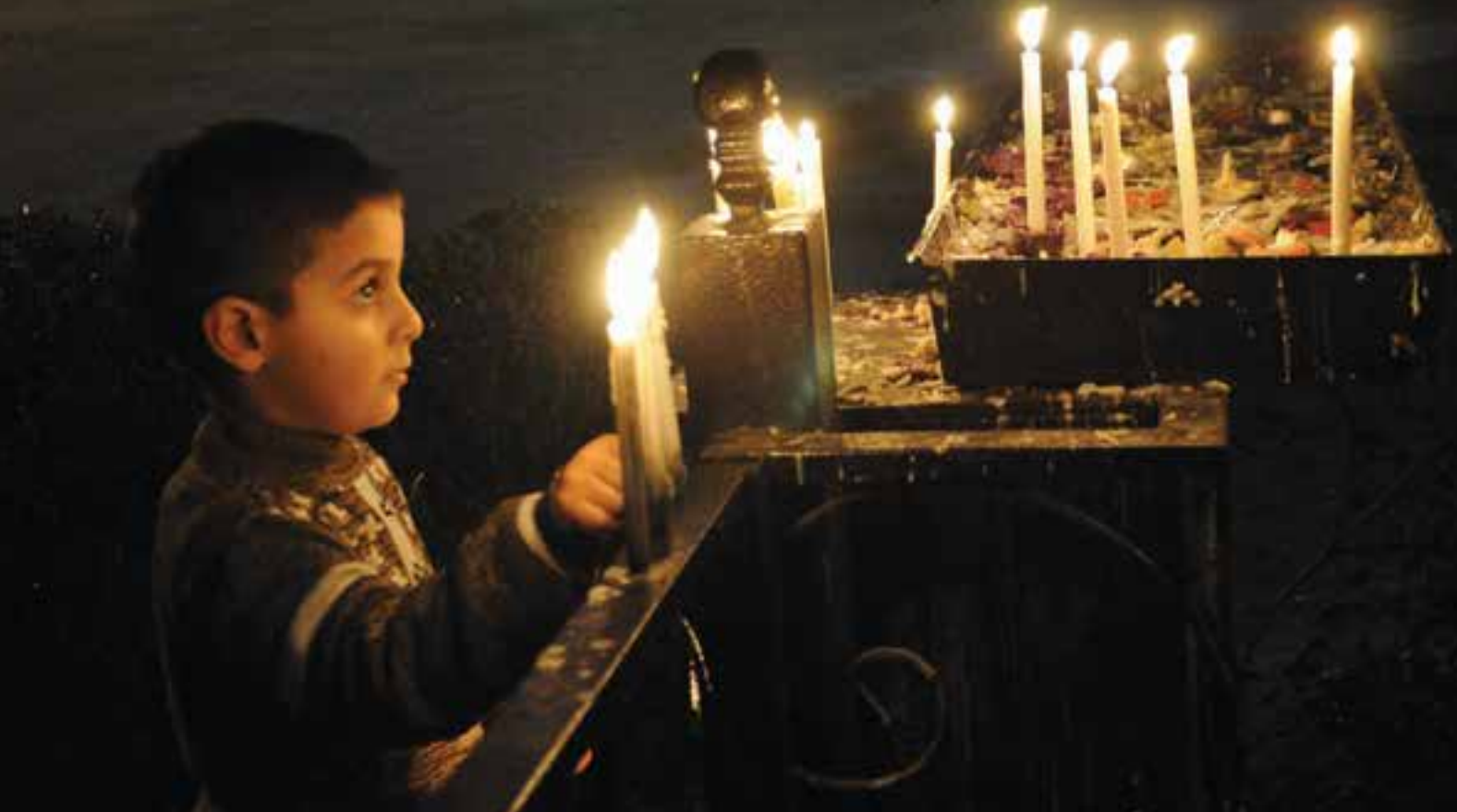
Boy with candles

DAY by day, reports received by Aid to the Church in Need show how the persecution of Christians is becoming ever more serious – affecting the lives of thousands upon thousands of faithful.