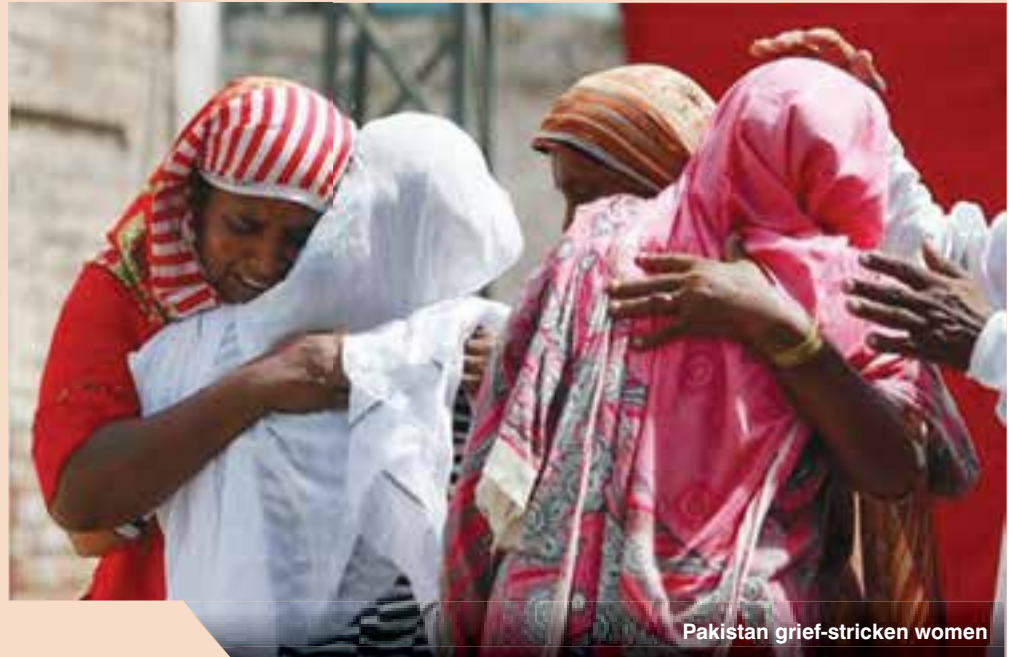
Pakistan grief-stricken women

ACN is supporting the project over three years. The charity has supported people accused of blasphemy, providing for their daily needs and organising vocational training. ●