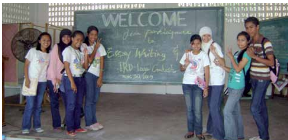
All teaching must be at the service of truth. It is young people, like these, who will benefit most from the small printing press in the diocese of Ruteng, in Indonesia.