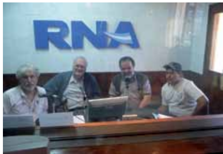
Whether in the studio or face to face, the media centre of “Nuestra Senora de Lujan” in Buenos Aires has many ways of proclaiming the Good News.