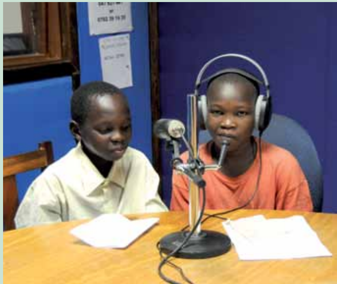
Young heads, wise words. You are supporting the radio broadcasts involving these youngsters in Arua, Uganda.

“God’s loving care for all people in Christ must be expressed in the digital world not simply as an artefact from the past, or a learned theory, but as something concrete, present and engaging.”