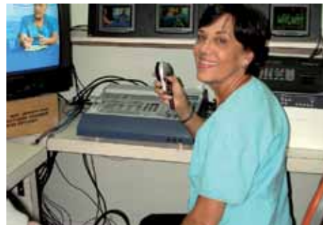
The joy of transmitting the truth. Broadcasting in the Caribbean.

None of us is a Christian for himself alone. Love always communicates itself. That is why the Good News must be proclaimed to the people and why St Paul, the Apostle to the Nations exclaimed “Woe to me if I do not preach the Gospel” (1 Cor 9:16). Today this happens increasingly through the media – via radio and television, the printed word, and the worldwide web.