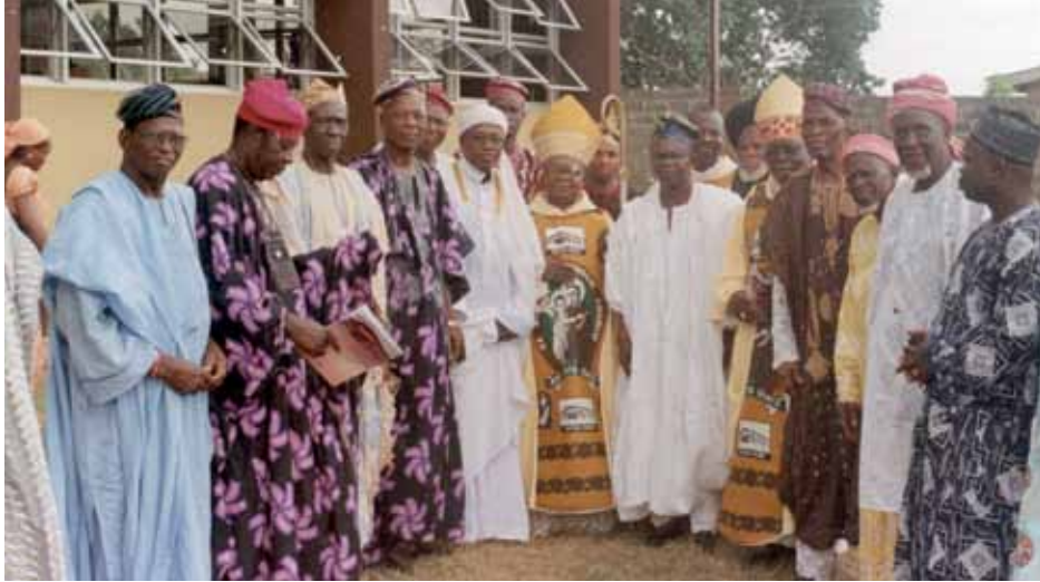
Oyo, Nigeria. Dialogue after the pattern of the world prayer meeting in Assisi. Here too the aim is to make visible the values of religious freedom, reciprocal respect and friendship.

The mystery of reconciliation is the mystery of love, for “all the history of mankind is the history of the desire to love and be loved”. These words of Blessed Pope John Paul II to the young people of France hold good for us all; indeed they sum up the history of our redemption and reconciliation.