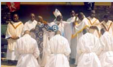
Unity in Christ – seminarians receive the blessing of their bishop.

Even among Christians, dialogue is a precondition for reconciliation. In the diocese of Kasongo, in the DR Congo, marked by so many years of bitter civil war, even the priests have in some cases become divided and suspicious of each other.