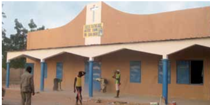
Where dialogue has taken solid shape – in Konni, Niger, Christians and Muslims are together building a shrine and place of prayer in honour of “Our Lady of Dialogue”.

Similarly precarious is the work of the community of Sant’Egidio in Karachi, Pakistan . This is a country where Christians are constantly under threat. The blasphemy laws are an open invitation to the arbitrary violence of Muslim fanatics. The Christians here need to be strengthened in their faith. Hence, the first “work” of the community is prayer, followed by catechism and Bible study, and finally meetings with other groups – as well as retreats and spiritual exercises for priests and seminarians. So the Christians remain ready to forgive and offer reconciliation, entirely in the spirit described by Benedict XVI in his book Jesus of Nazareth : “Zeal for love and for the Cross must be the guiding orientation of the Christian.” For this work in laying the foundation stones of love the community needs prayer books, Bibles, catechisms and financial help for its missionary journeys. ●