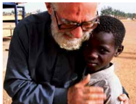
A spiritual fatherhood that transcends the human dimension.