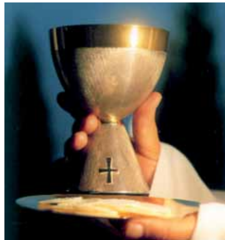
“Do this in memory of Me.” No priest means no Calvary today.

As Pope Benedict XVI said to a group of priests in 2005, “Christ really is the Face of God, but we should also deepen this certainty and the joy of knowing it and thus truly be ministers of the future of the world, of the future of every person.”