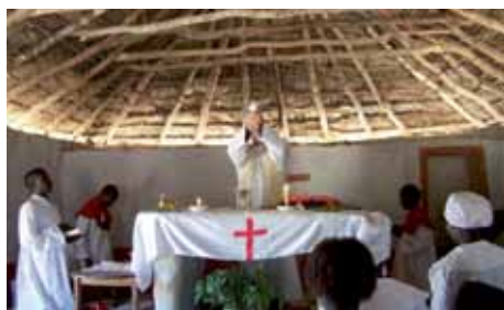
“The priest is a priest for you” (Curé of Ars) – in Zambia as elsewhere.

may fulfil the desires of your hearts”. Similarly, the 56 priests in the diocese of Raigarh, in India , and the 28 priests in the archipelago that constitutes the diocese of Tarawa and Nauru in the Pacific Ocean, and the 31 in the diocese of Mpika in Zambia could not survive without your Mass offerings. Like many others more they place their lives in the hands of God, just as God places his work of redemption in their hands. Let us support their uplifted hands, just as Aaron supported the hands of his brother Moses – for the sake of the future of the People of God. ●