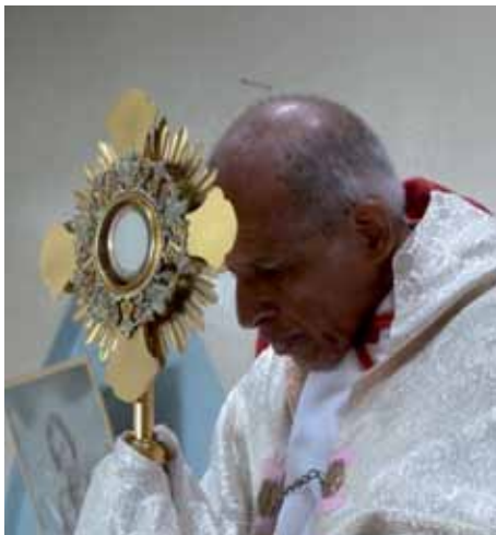
Latens Deitas – Godhead here in hiding. Adoration and Benediction in Haiti.