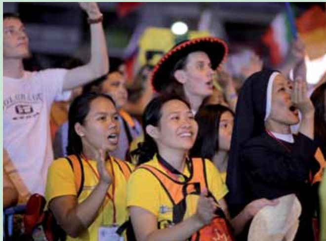
Applause for the Pope at the WYD in Madrid. Benedict XVI inspired great enthusiasm everywhere.

“God is the source of life. To set God aside is to separate ourselves from that source and, inevitably, to deprive ourselves of fulfilment and joy.”