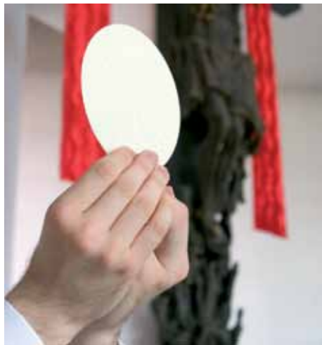
“This is My Body.” But what if there were no priests?